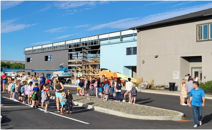
September 2023 expansion at Calvary School, Kennewick.

The Redeemer Lutheran School Exploratory Committee is assembling materials for an Archibald and Company Architects Preliminary Design Plan .