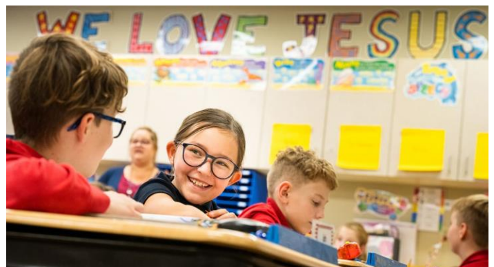
Class at Trinity Lutheran School in Freistadt, Wisconsin.

All elements of the Preliminary Design Plan will help the Redeemer Voters' Assembly make wise decisions and avoid costly errors, when considering opening a Lutheran school at Redeemer. The demand for Christian schools is high. Calvary, Liberty Christian, Christ the King, and Tri-Cities Prep have waiting lists; the