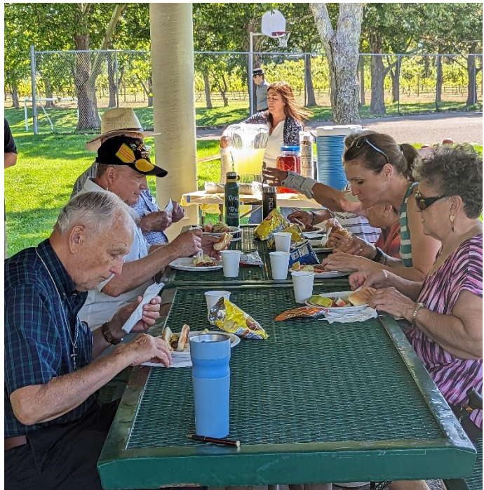
Enjoying a lunch of grilled hot dogs, potato salad, watermelon, baked beans, and chips.